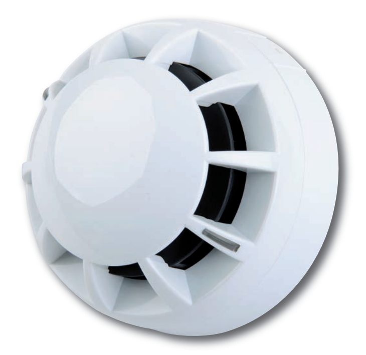
Illustration shows a C4416 ActiV optical smoke detector mounted on a C4408D base

The detector is fully compatible with our C4408 range of ActiV bases, all of which include an integrated detector/base locking mechanism to prevent tampering. A plastic ID tag is also supplied with all C4408 range bases allowing engineers to identify which zone the detector has been connected to.